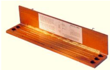
Bearing Fillers, Telescopic 6505xx 0,1 – 0,5mm 6505xx 0,6 – 1,0mm