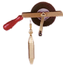
Oil Gauging Tapes 10m, 15m, 20m, 25m, 30m, 50m 6508xx Metric, White 6508xx Metric, St. Steel 6508xx Metric & Inch, White 6508xx Metric & Inch, St. Steel