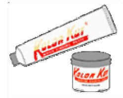
Kolor Kut 650890 Water Finding Paste 650891 Gasoline & Oil Finding Paste