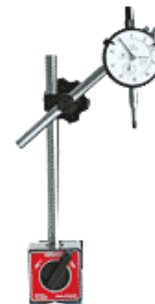
Dial Gauge & Bases 651403 Dial Gauge 10mm 651427 Magnetic Base, Universal 65142x Magnetic Base, Flexible