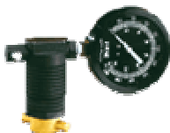
Engine Peak Indicators 652634 0 – 140 Kgf / cm 2 6526xx 0 – 210 Kgf / cm 2 6526xx 0 – 250 Kgf / cm 2