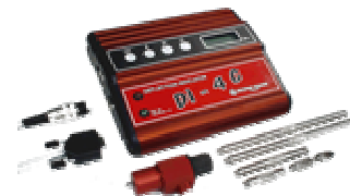
Crankshaft Deflection 6526xx Digital Gauge 89-565mm