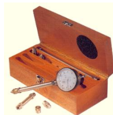
Crankshaft Deflection 652670 Manual 90-535mm