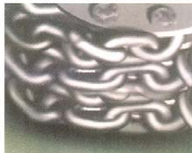
DS 500-1 Chain (25 pcs/set)