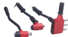
Pneumatic Piston Scalers 590382 1-Piston 590383 3-Pistons