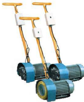
Electric Deck Scalers Chain Type 5922xx 440V 50/60Hz 5922xx 220/380V 50/60Hz