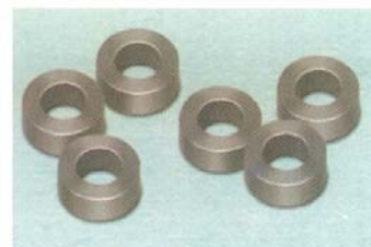
DS 500-5 Collar (25 pcs/set)