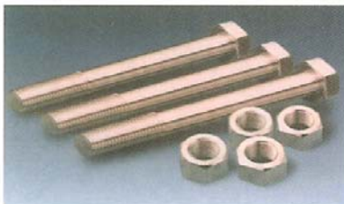
DS 500-3 Bolt & Nut (10 pcs/set)