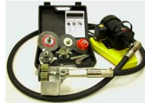
Electric Scaling Machines 591417 110V 50/60Hz 591418 220V 50/60Hz