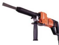
Electric Needle Scalers 591201 110 V 50/60Hz 591202 220V 50/60Hz