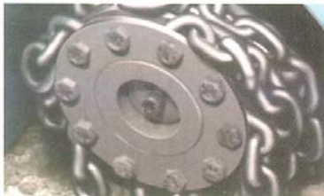
DS 500-0 Chain Drum (all spare parts)