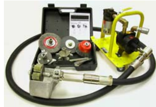
Pneumatic Scaling Machines 591281 2 H.P.