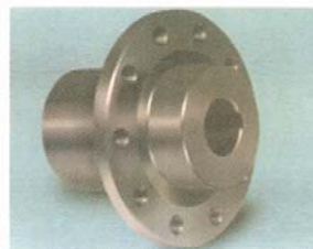
DS 500-4 Boss (1 pc)