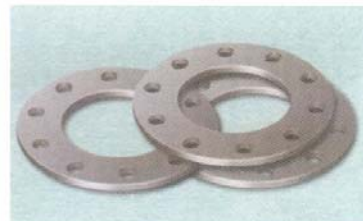
DS 500-2 Plate (5 pcs/set)