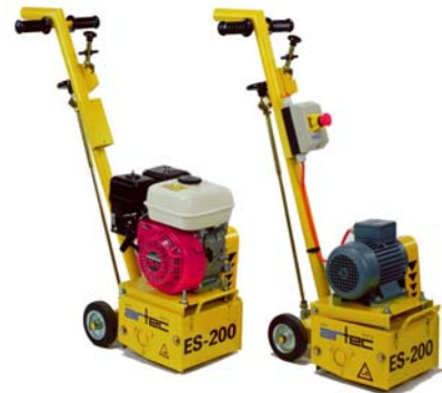
Electric Deck Scalers Gear Type 5922xx 440V 60Hz 5922xx 220V 60Hz 5922xx 110V 60Hz 5922xx Gasoline Engine